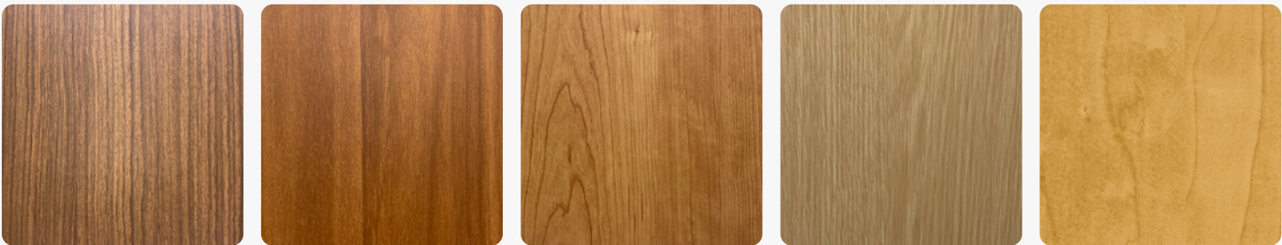
Roma Noce Rustic Timber Autumn Cherry Pearl White Oak Miele Maple