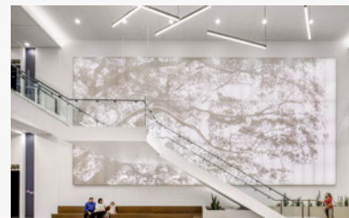
Vapor® Graphic Perf®