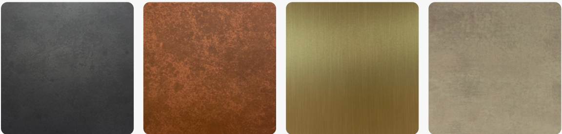
Hollywood Parisian Rust Hampton Brass Vintage Nickel